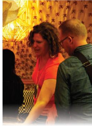
BEFORE THE SHOW DURING THE SHOW AFTER THE SHOW OFFICIAL PARTNER HOTEL ACCREDITED HOTELS